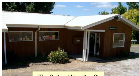
'The Cottage' Hamilton St - site of new op-shop

Ladies from the CWA and others have volunteered their time to run the shop, and a call for goods will be advertised very soon.