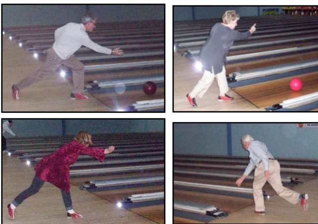
Some were sure of what to do!

Installing insulation in ceilings can save up to 41,800 black balloons each year.