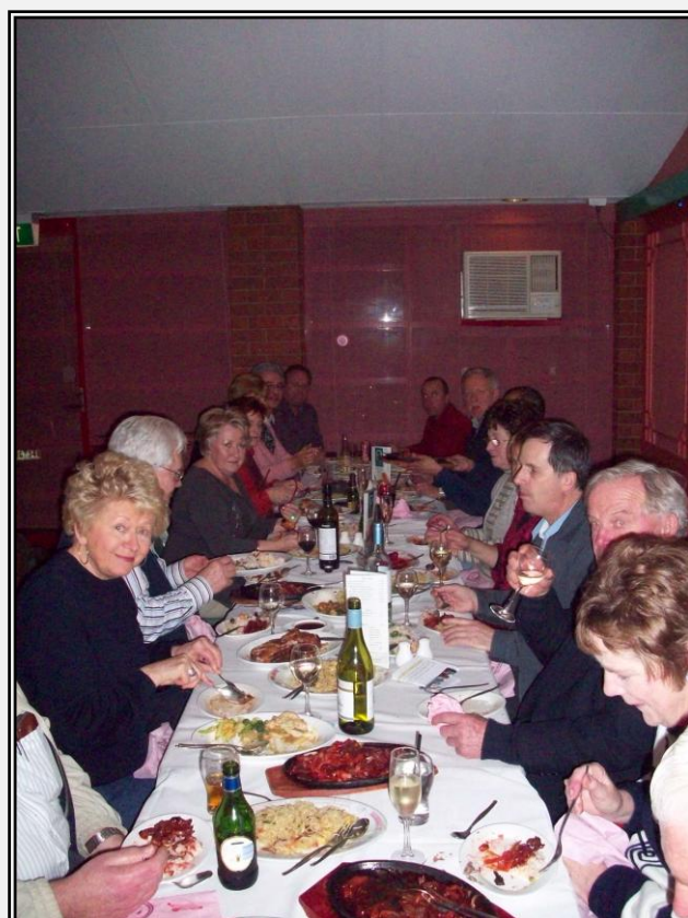
Good Food, Good Fellowship – what more could we ask for!