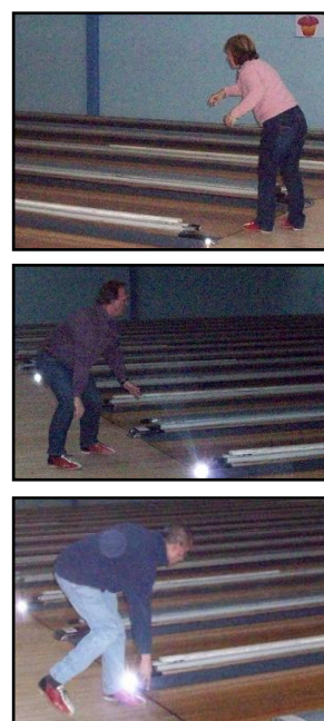
While others seemed to hesitate!