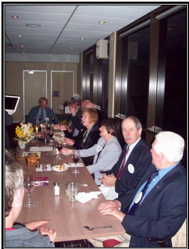
Top table with President Sue in charge.